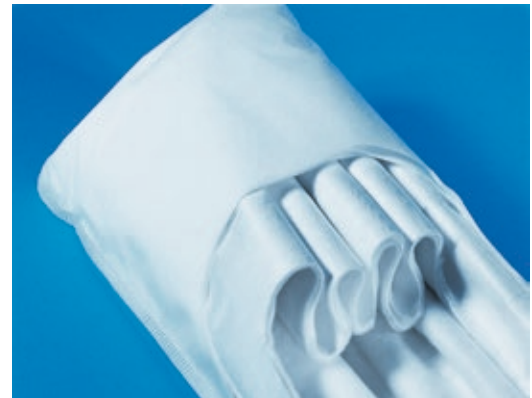
A pleated pre-filter offers a very large filter area (approx. 32 ft² (3 m²)), to retain gels and solids before they reach subsequent filter layers.